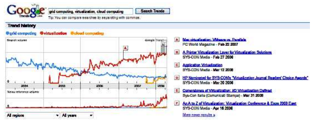
Fig. 1 Cloud computing in Google trends

line), which is enabled by virtualization technology (the yellow line), has already outpaced the Grid computing <sup>8)</sup> (the red line).